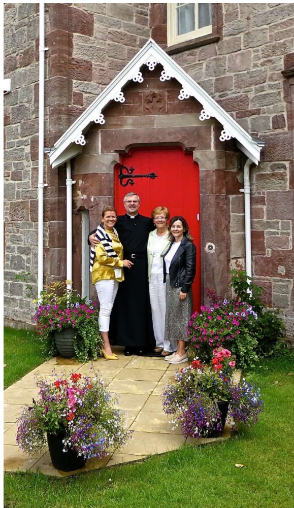
The Magazine of St Michael And All Angels Episcopal Church, Helensburgh www.stmichaelhelensburgh.org.uk

ST MICHAEL AND ALL ANGELS, WILLIAM STREET, HELENSBURGH