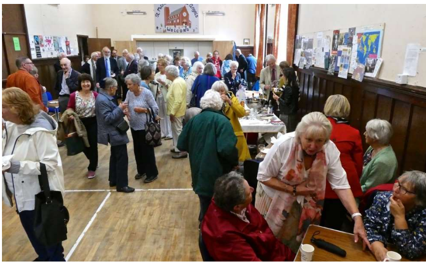
3 After the Eucharist